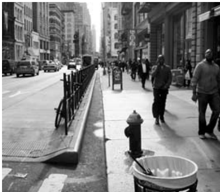
bus stop feature out of the way of foot traffic

Lots of people walk in Manhattan. It is by far the easiest way to get around, and with the subway for longer journeys many people don't own cars - a surprising number have never learned to drive! They just don't need to.