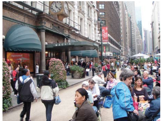
Pausing outside Macy's department store

of a new freeway. The benefits were that they reaped the 'green dividend' - people in Portland drive 4 miles less than other US residents each day resulting in an extra $800million which is then circulated around the economy. Crucially, this money stays within the community rather than being spent on imported goods such as cars and fuel. Melbourne is another example how a sustainable transport system and increased city densities transformed the city into what is now considered one of the most liveable cities in the world.