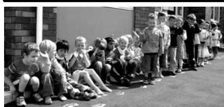
Hamilton's Kid Klub