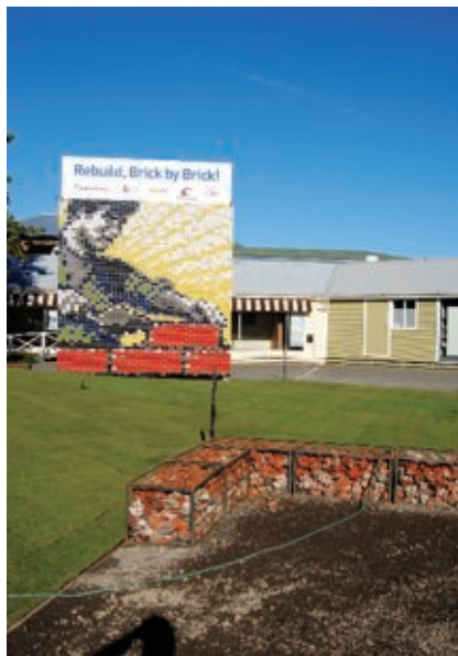
Above: Photo series from Rhys Taylor showing the greening-the-rubble process!

Victoria Green provides the public with a new path between two streets, both flat and sloping turf lawn areas, simple seating made from volunteer-welded structures of steel mesh (gabions) filled with broken bricks, also beds for wildflowers and innovative hard fill surfaces whose materials include recycled bricks and ground glass. Some of the hard surfaces are ready for native trees to arrive, in planter boxes loaned by the Council.