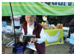
Above: photos from Auckland's walk 2 work day in 2010 and some of the goodies in store!