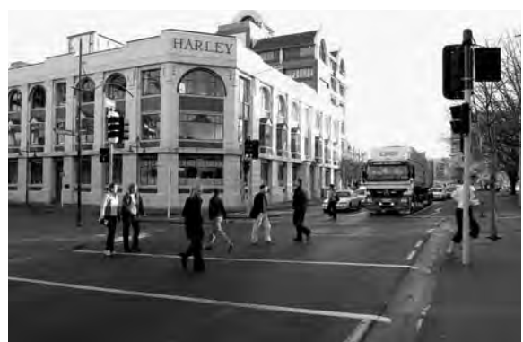
Pedestrians enjoy the cleaner air and quiet due to fewer cars

"improving public health is one of the most pressing issues of our time."