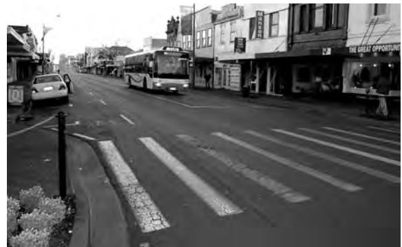
South end of Colombo Street, unusually 'minus cars'!