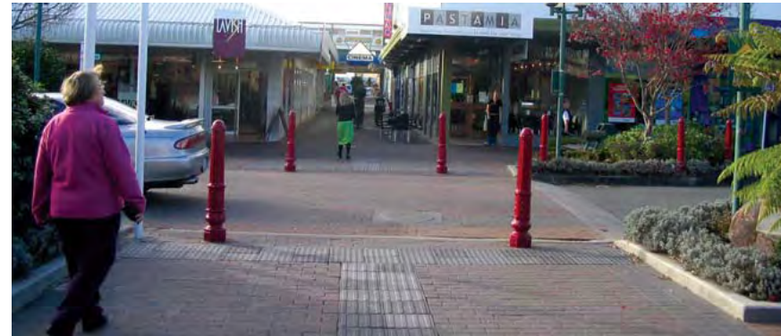
Blended kerb crossing at platform, Taupo