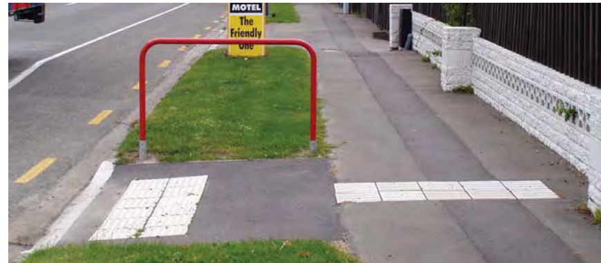
Kerb ramp, Featherston St, Wellington