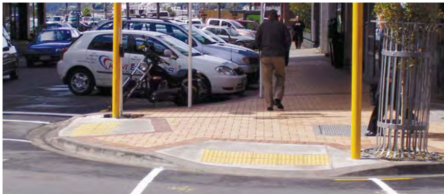
Kerb ramp, Featherston St, Wellington