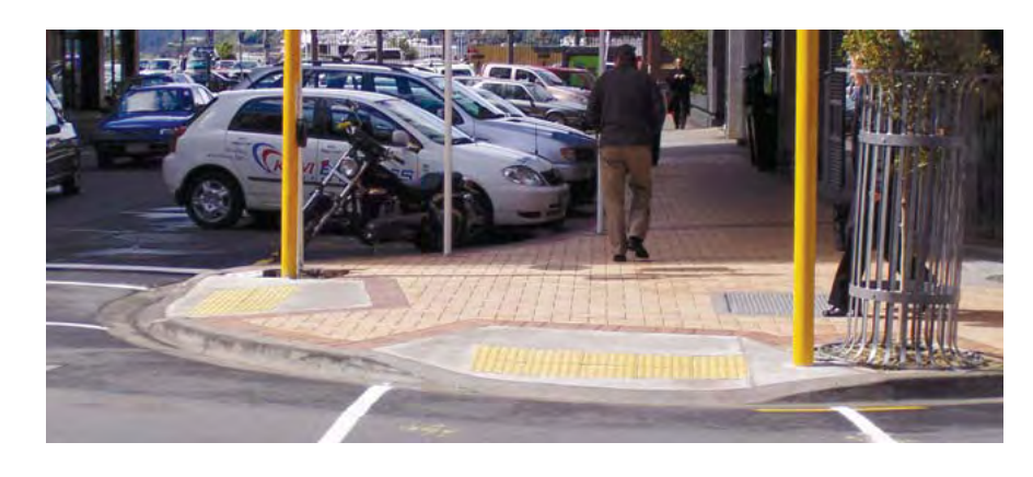
Kerb ramp, Featherston St, Wellington