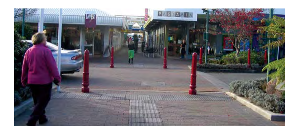
Blended kerb crossing at platform, Taupo