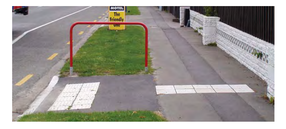
Kerb ramp, Featherston St, Wellington